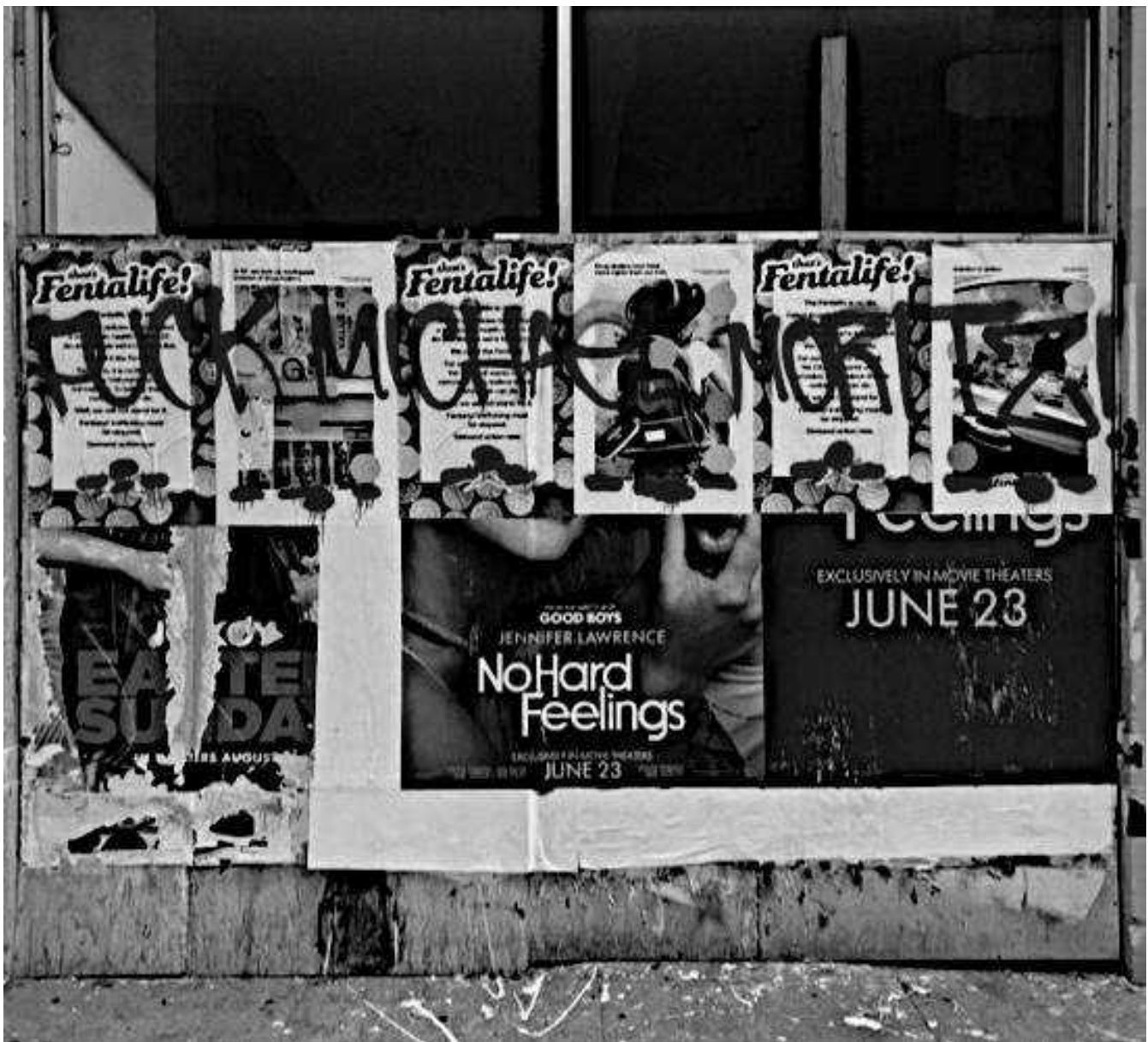
Graffiti reads, “Fuck Michael Moritz!”

A “street art” campaign backed by Welsh tech billionaire and venture capitalist Michael Moritz is being targeted by graffiti artists in San Francisco, California. The campaign features posters and even wheat-pastes which call for a “law and order” approach to homelessness and fentanyl related deaths in San Francisco.